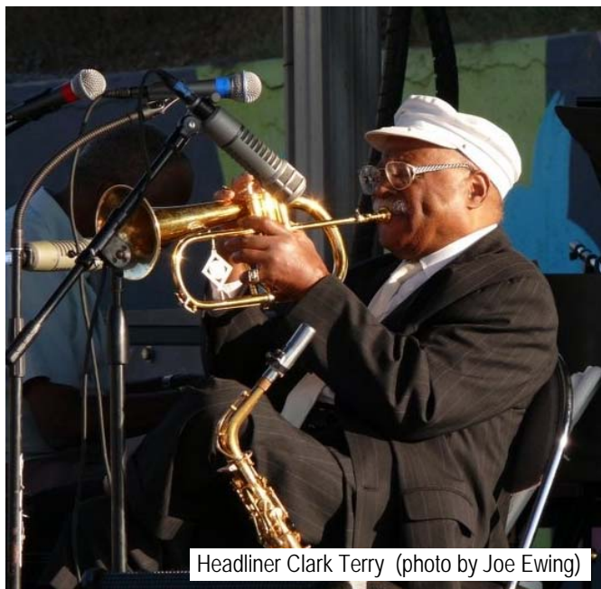
Headliner Clark Terry