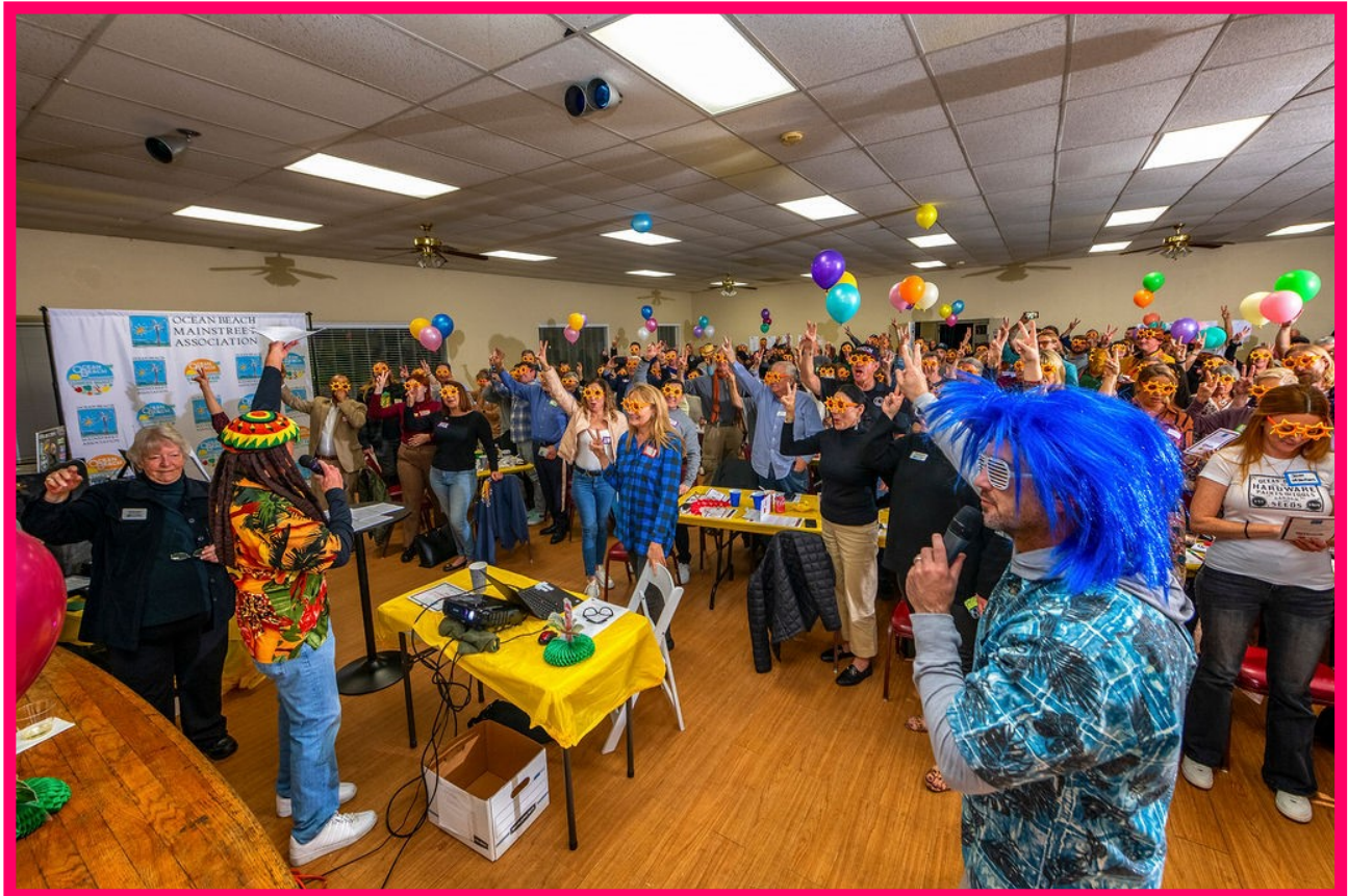
The OB Pledge of Allegiance

Click here to view the OBMA Annual Awards Presentation & a list of ALL AWARD RECIPIENTS.