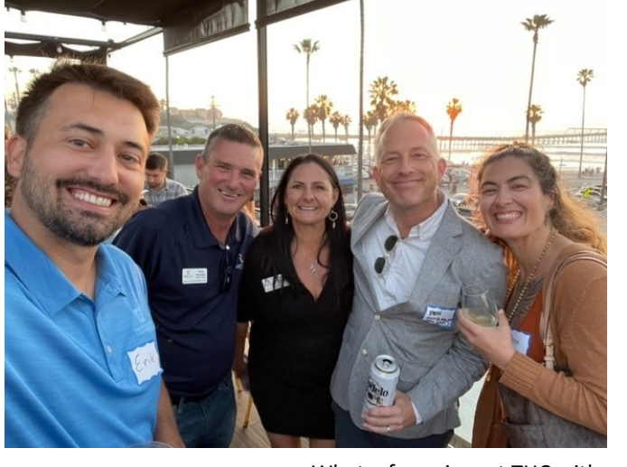
What a fun mixer at THC with team from Rest & Relax Real Estate and Finance of America!