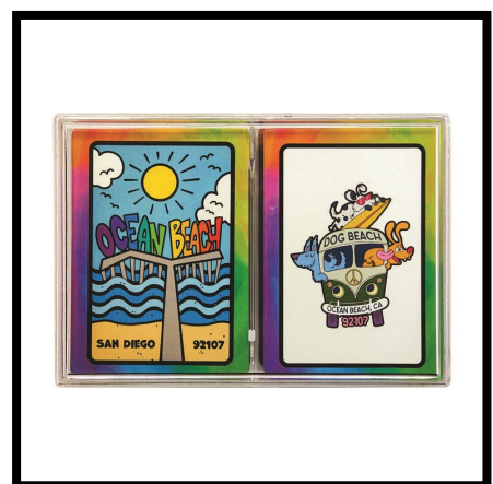
OB Playing Cards $17.95 + tax