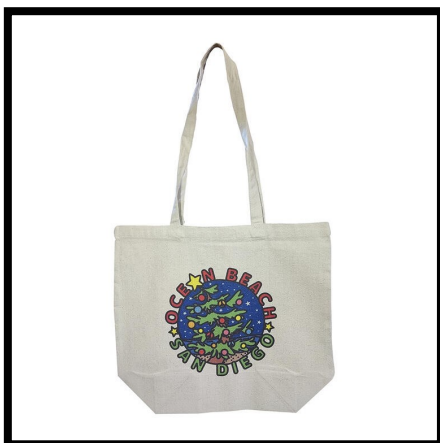
OB Holiday Tree Tote Bag $16.50 + tax