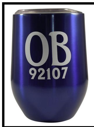
Double Insulated Tumbler $16.95 + tax