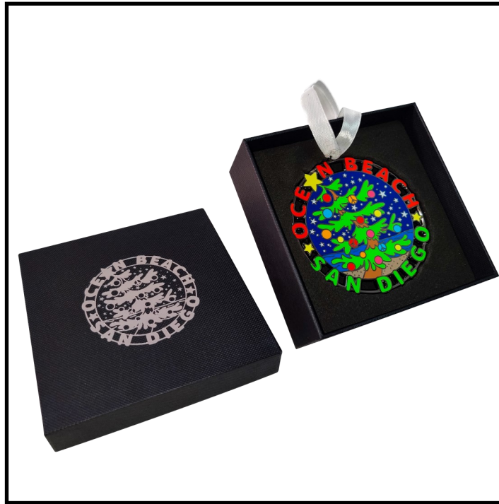
2022 OB Holiday Tree Ornament $25.00 + tax