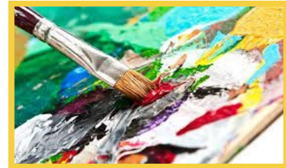
Canvas painting classes will be available throughout the day on June 26th in OB.

Enjoy a Celebrate OB Collaborative Pale Ale at OB Brewery and select breweries & restaurants throughout Ocean Beach beginning June 26, 2021. The Ocean Beach MainStreet Association invites you to come out and enjoy Ocean Beach and spread good vibes.