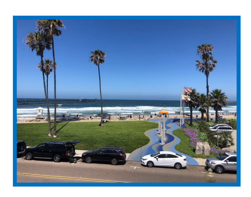
A rendering of the New Veterans Plaza.