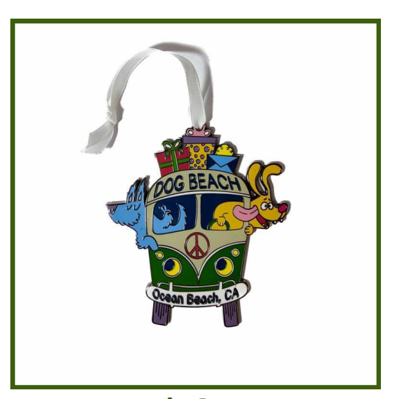
Dog Beach Ornament