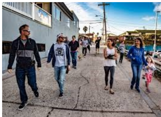
This year our volunteers will be bring their masks along with their holiday cheer!